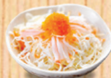
House Salad ハウスサラダ