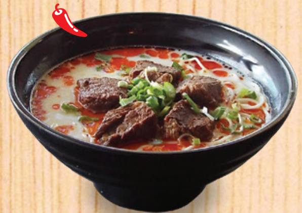
Spicy Beef Ramen 激辛牛肉ラーメン 香辣牛肉拉麵 $17.25