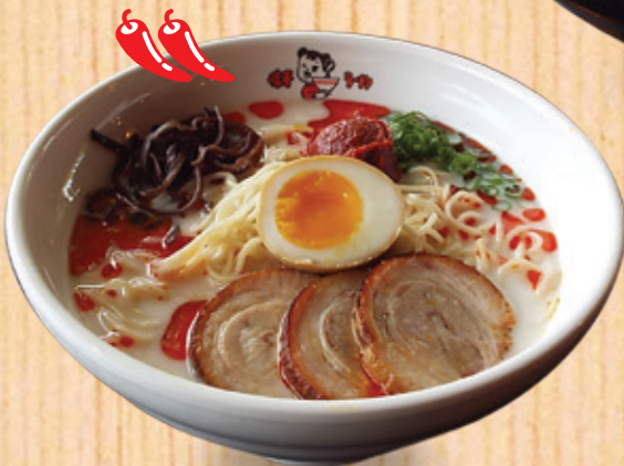
Spicy Miso Ramen ピリ辛味噌ラーメン 辛辣味噌拉麵 $15.25