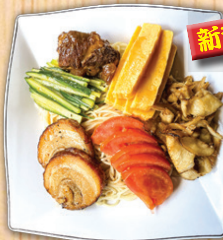
Ajisen Deluxe Cold Ramen (Ajisen House Dressing) Tender Pork ribs / Premium Pork / B.B.Q Pork 味千デラックス冷麵(味千ハウスドレッシング) 味千冷麵升級版 (配味千秘製冷麵汁) $16.75