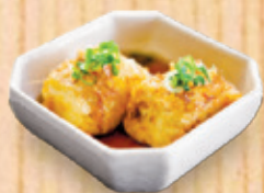
Fried Tofu (2pcs) 豆腐の土佐揚げ

加 2 元可選擇其中 一款小食或飲品 Choose any ONE of these items or drinks for $2.00