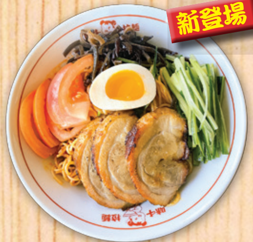
Spicy Garlic Mazemen (Dry Style Ramen) スパイシー ガーリックマゼメン 蒜香辣拌麵 $13.95