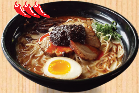
Volcano Ramen 火山ラーメン 火山拉麵 $15.75