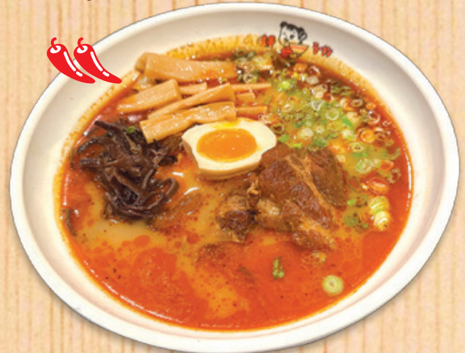
Spicy Tender Pork Ribs Ramen ピリ辛豚なんこつラーメン 辛辣豬軟骨拉麵 $16.95