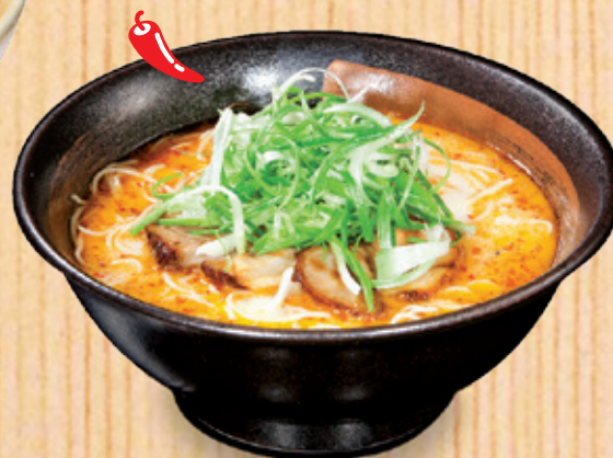
Scallion B.B.Q. Pork Ramen ネギチャーシューラーメン 香蔥叉燒拉麵 $15.75