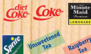
Soft Drinks ソフトドリンク