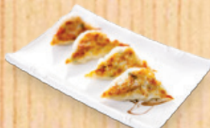
Gyoza Dumplings (4pcs) 手作りギョーザ