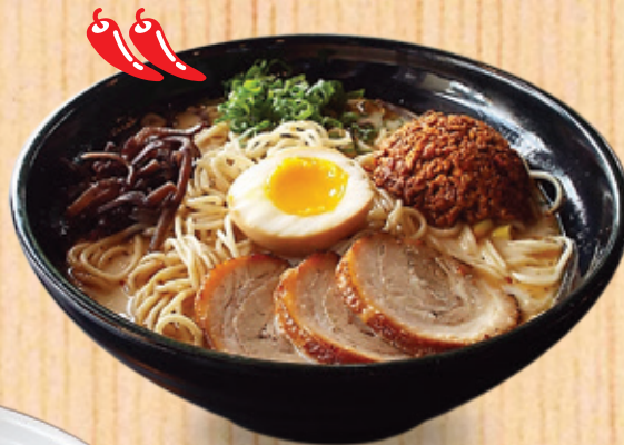
Ajisen Spicy Pork Ramen ピリ辛味千ラーメン 辛辣味千拉麵 $15.45