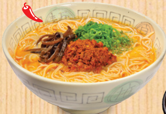
Tan-Tan Men 担担麵 担担麵 $15.25