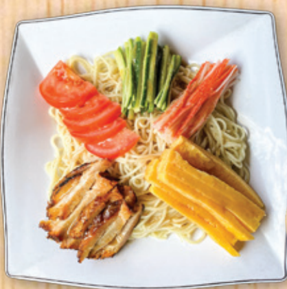
Ajisen Cold Ramen 味千冷麵 (味千ハウスドレッシング) 味千冷麵 (配味千秘製冷麵汁) $15.25